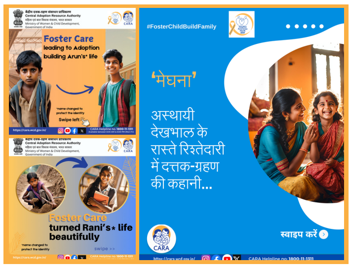
Take a look on these 3 beautiful Success Stories on CARA Social Media Handles

Tamil Nadu, Uttar Pradesh and Gujarat top the state-wise participation