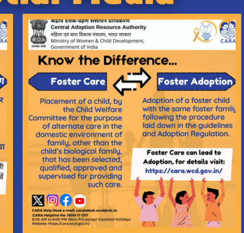
Daily Posting of Info-graphics focused on Foster Care & Adoption