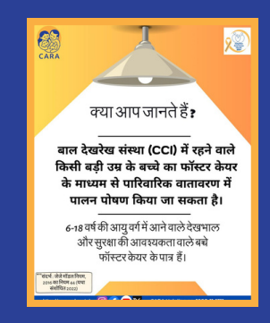
Posting Info-graphics in Did You Know Format